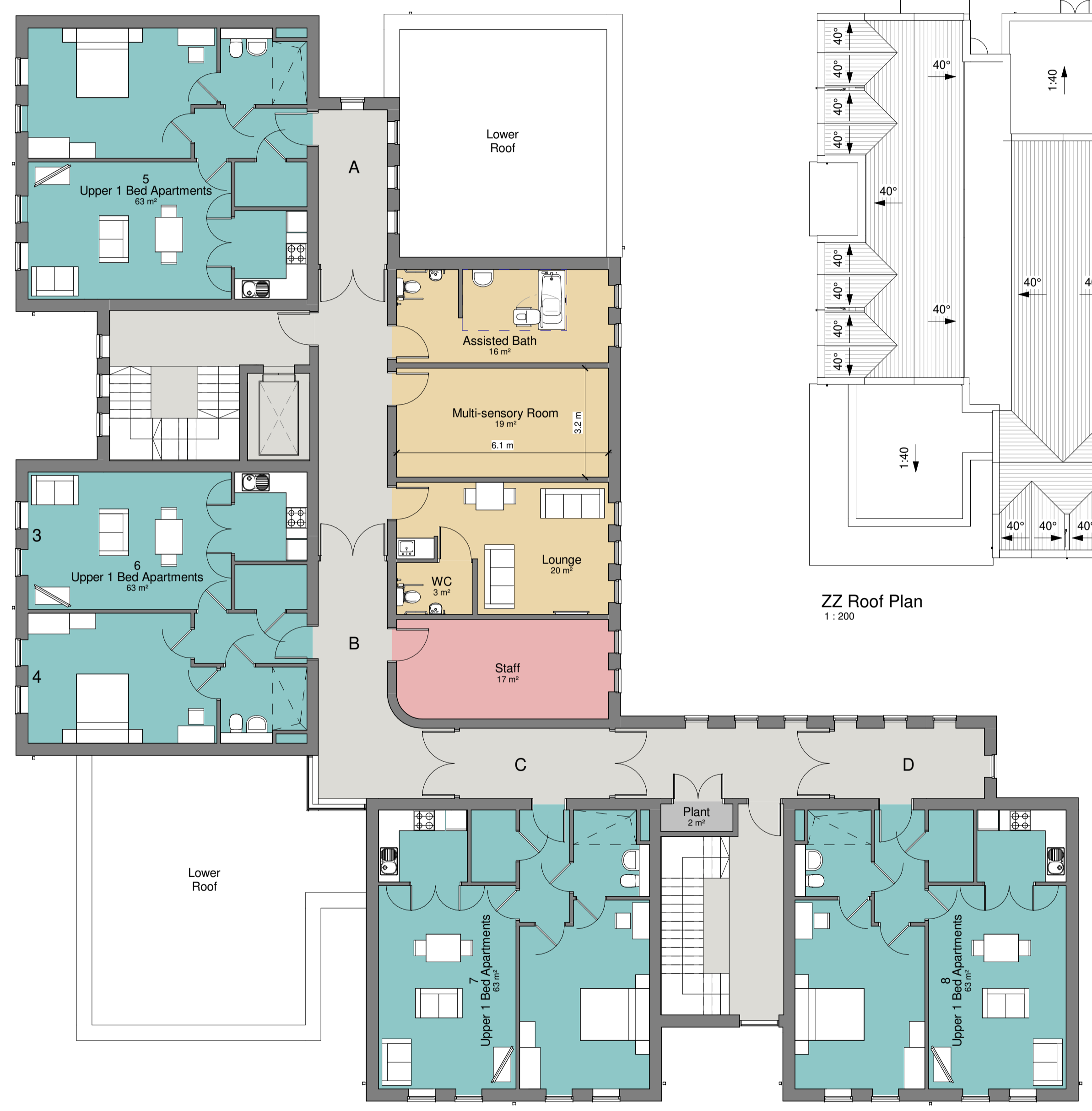
01 First Floor 1:100