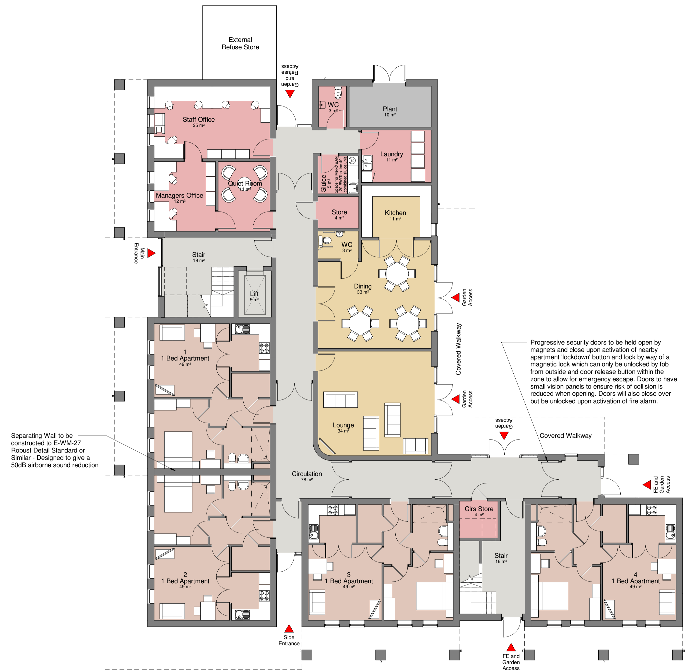
00 Ground Floor 1:100

Notes: This drawing is the copyright Paddock Johnson Partnership Limited and may not be used without their prior written consent. Written dimensions to be taken in preference to scaled dimensions. Due to the inaccuracies of scanning, scanned images should not be scaled. REV. DATE DESCRIPTION BY: A 21.7.20 Additional Detail Shown PO B 4.8.20 Revised to client comments PO C 14.8.20 Roof Plan Added PO D 18.9.20 Planning Issue PO E 13.11.20 Upper Apartments Combined to make 4 large apartments PO