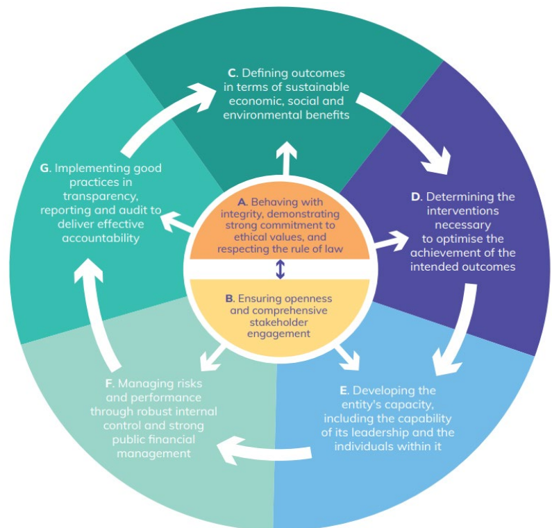
Figure 1: Establishing an effective assurance framework

Often, assurance is associated with the work of internal and external audit. They do provide assurance, and because their assurance is independent of the service or function, it is of particular value to the leadership team. They are not the only sources of assurance, however, and an assurance framework will create a better understanding of how assurance is provided. Many authorities will use the Three Lines Model developed by the Institute of Internal Auditors (IIA) to group or identify the different sources of assurance.